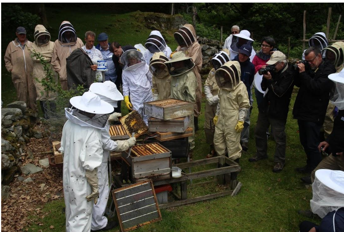
Examining our Temperature Monitored Hive at Lleyn & Eifionydd BKA Meeting 16 th June 2019 accompanied by a group of visiting beekeepers from Switzerland